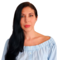
Irina Soldatenko WhatsApp message