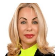
Inna Hilevich WhatsApp message