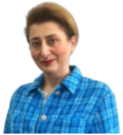
Marina Faradjev WhatsApp message