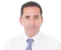
Darren Rich WhatsApp message