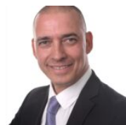
Eyal Rosenboim WhatsApp message